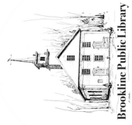
Brookline Public Library

Hours: Monday ..... 10 AM - 8 PM Tuesday - Wednesday ..... 10 AM - 6 PM Thursday ..... 12 PM - 8 PM Friday ..... 2 PM - 6 PM Saturday ..... 10 AM - 2 PM Sunday ..... Closed