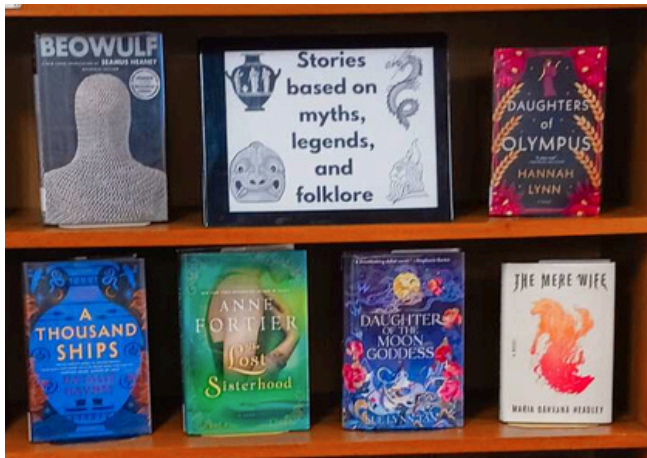
Check out our display downstairs this month to see some stories based on myths, legends and folklore!