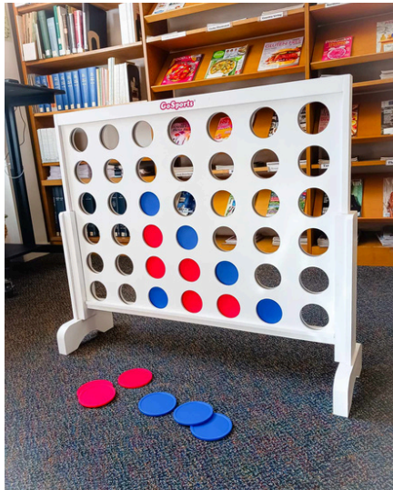
We have a Giant 4-in-a-Row game available to borrow