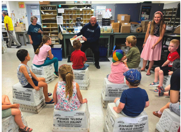
Kids got to hear stories at the Brookline Post Office.

We got to visit Winterberry Farm, where kids got to pet goats, donkeys, sheep and more. At the DPW, along with the stories, kids got to try out the front seats of the town's public works equipment and see how big it really is. The Brookline Safety Complex was so popular, we had to go twice! Kids got to meet the police officers, check out the patrol cars and ambulance and see the inside of the jail cells (don't worry, no one got locked in.) For more photos and to check out where else we got to go, visit the library's facebook page (@bpl_nh)!