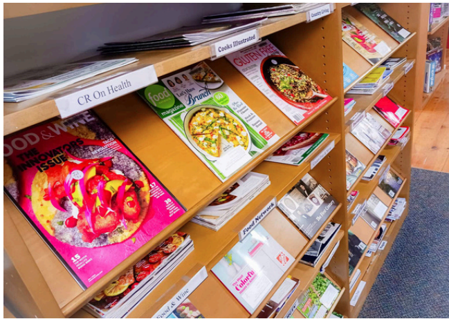
Visit the new section for some of the latest issues of many popular magazines